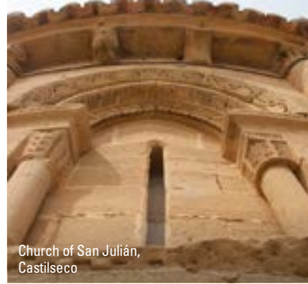
Church of San Julián, Castilseco

Continue on to Treviana to the chapel of La Concepción, a quaint unfinished Romanesque building that was recently restored. The ending point is Cuzcurrita de Río Tirón and its beautiful chapel of Sorejana, built in the 13th century and extended in the 16th century with three Gothic sections. In 1981 it was declared 'Bien de Interés Cultural' (Cultural Interest Asset).