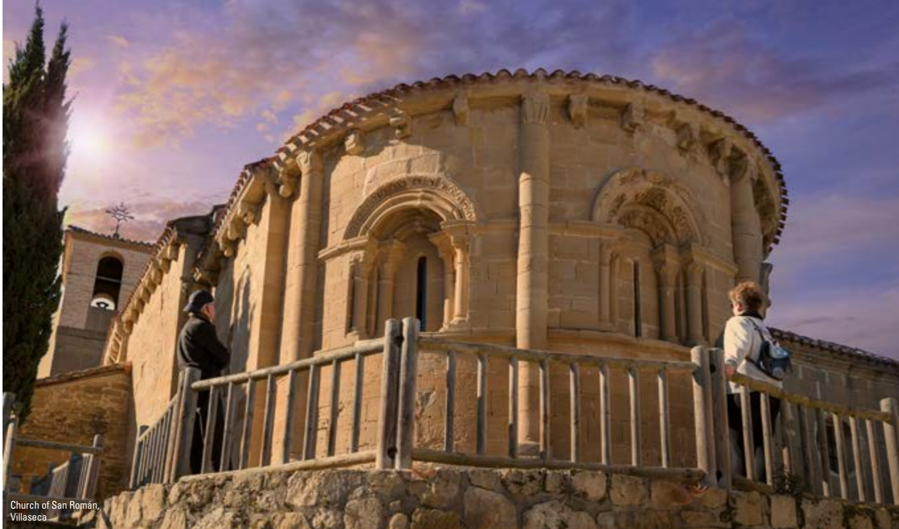
Church of San Román, Villaseca

Tirgo - Cuzcurrita de Río Tirón 1.3 Km 3 minutes