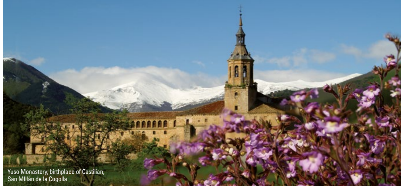
Yuso Monastery, birthplace of Castilian, San Millán de la Cogolla