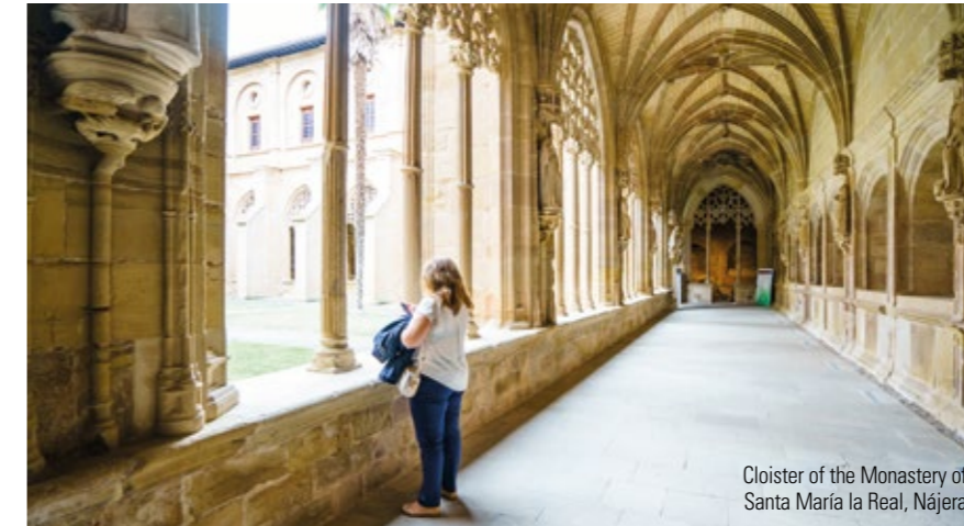
Cloister of the Monastery of Santa María la Real, Nájera

Few valleys have the same patrimonial wealth as the valley of the Cárdenas river. The itinerary starts at the main town in the region, Nájera, where you can visit the Monastery of Santa María la Real. Built by king García Sánchez III and finished in 1052, it's a mixture of Baroque, Late Gothic and early Renaissance styles. Its royal mausoleum houses the twelve graves of two different dynasties (Abarcas and García Ramírez). The Cloister of the Knights is the burial site of many noblemen.