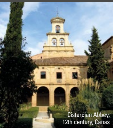
Cistercian Abbey, 12th century, Cañas

*San Asensio - Casalarreina 21 km 18 minutes