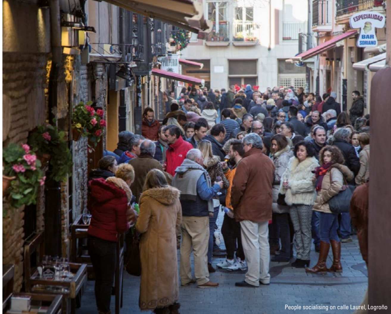
People socialising on calle Laurel, Logroño