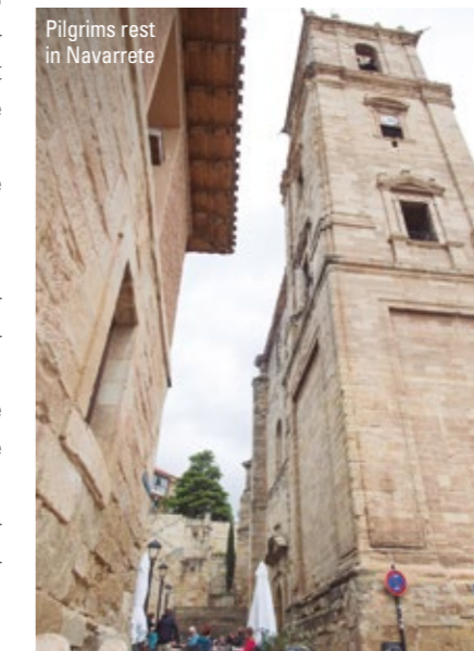
Pilgrims rest in Navarrete

The next stop is Nájera, commonly known as the 'furniture capital', due to its manufacturing and furniture sale businesses. This town and its region also have agriculturally-based activities, especially vineyard-oriented. Regarding patrimonial buildings, the Monastery of Santa María La Real is worth a visit. Built by king García Sánchez III in the 10th century, it became an episcopal see and a royal mausoleum.