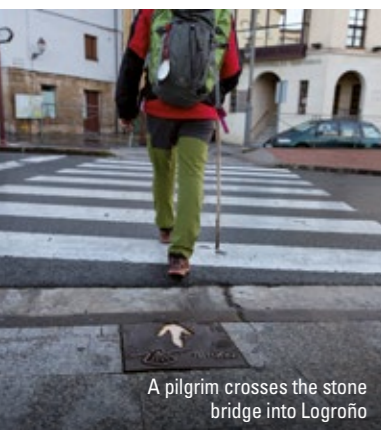
A pilgrim crosses the stone bridge into Logroño